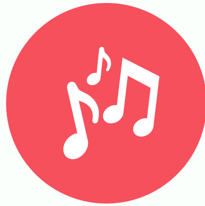
Sonos Music System